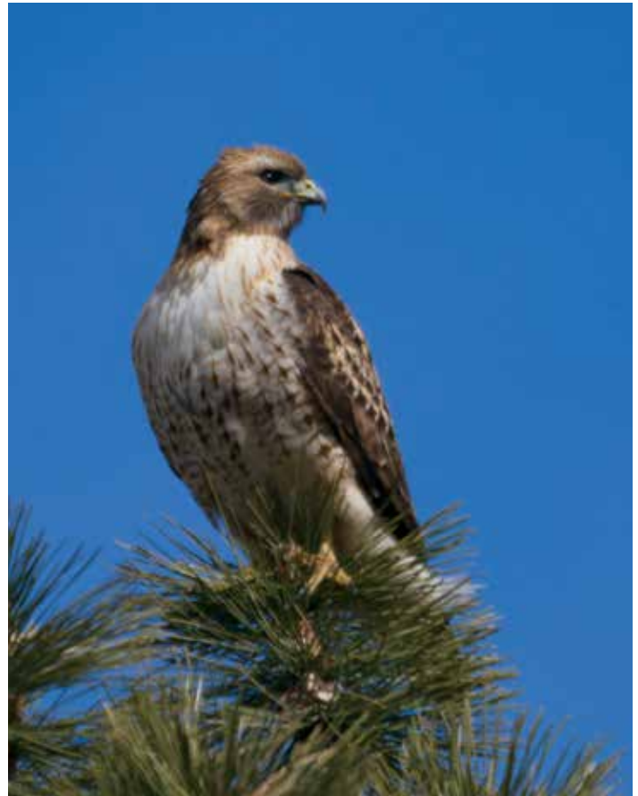
Red-tailed Hawk

The RED-TAILED HAWK is a large and very successful raptor. I'm involved in a raptor monitoring study in Boulder County that has been conducted for 43 years. Such long-term studies are immensely important to show population trends. These data reveal that Red-tailed Hawks have increased during that time while other raptor species have declined, sometimes drastically. Red-tailed hawks are generalists and have done well even as human populations have increased. They prey on prairie dogs, voles, rats, rabbits, and others.