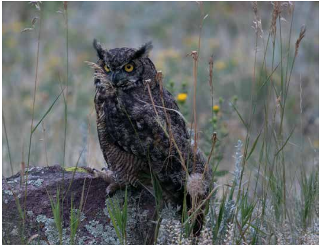
Great Horned Owl

The GREAT-HORNED OWL is common and you may know it more by its hooting than by seeing it. They nest very early, starting in January, prey on a variety of mammals and are one of the few predators of skunks as the owls do not detect the odor. They typically spend the day on a large branch close to the tree's trunk and are surprisingly difficult to spot.