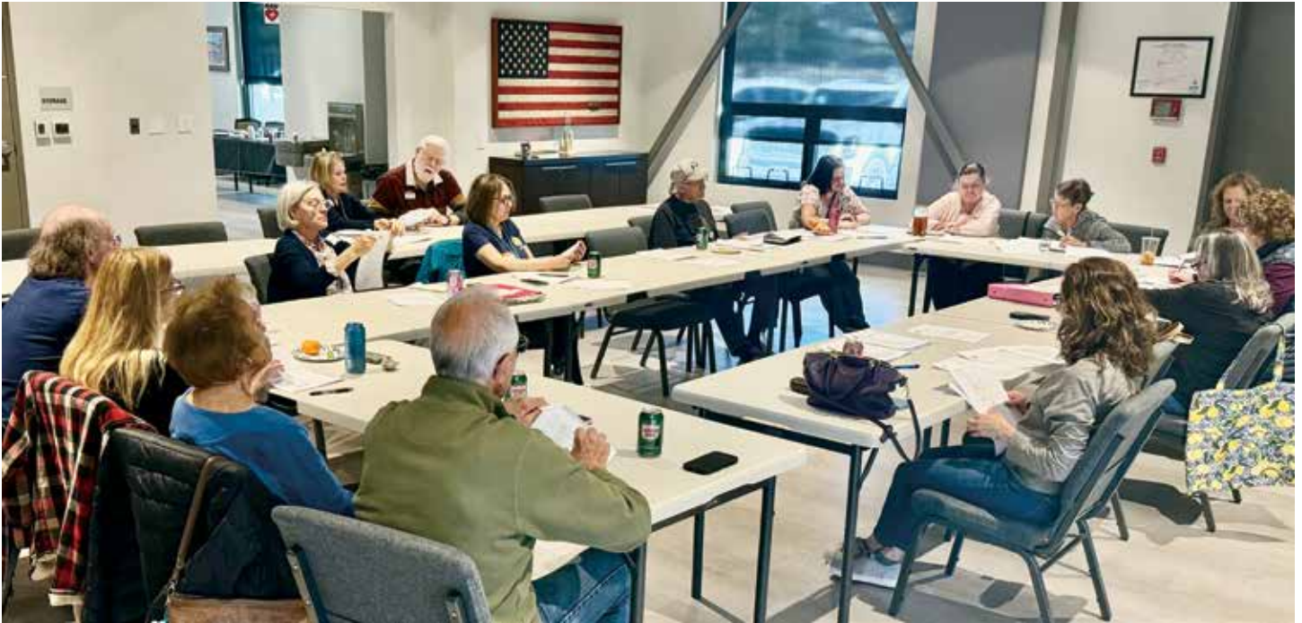
Auxiliary Membership Meeting – April 19th

The Auxiliary's mission is to promote the safety and effectiveness of BMFPD's emergency responders. We organize activities throughout the year geared toward: