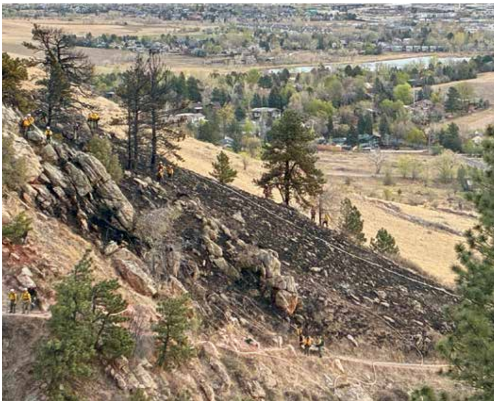
Goat Trail Fire.