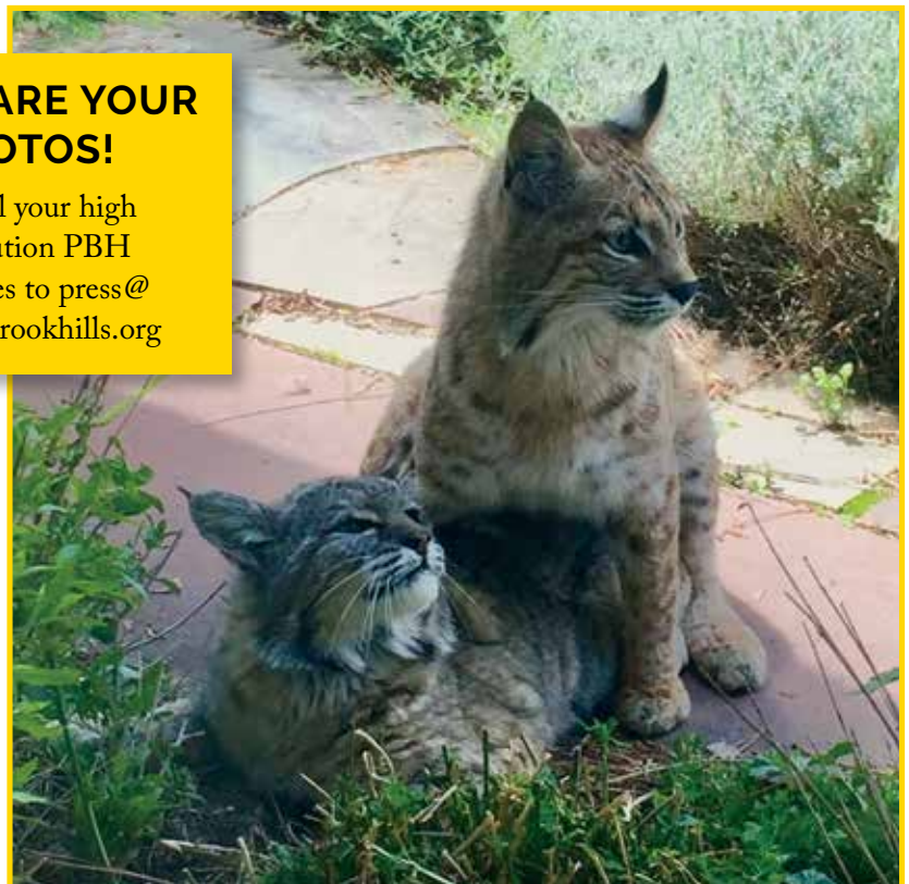
Bobcats by Caren Paul

Email your high resolution PBH images to press@pinebrookhills.org