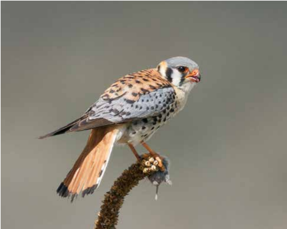
American Kestrel

The AMERICAN KESTREL is a falcon, our smallest one. It preys on grasshoppers, other insects, and small mammals. Unfortunately, their populations have declined by over 50% since 1966 in North America, with steeper drops exceeding 90% in some areas. They are a species of conservation concern due to habitat loss, pesticide use, and reduced nesting cavities; when insects and small mammals are part of an animal's diet, rodenticides and insecticides are exceedingly harmful. They will use nest boxes built for them.