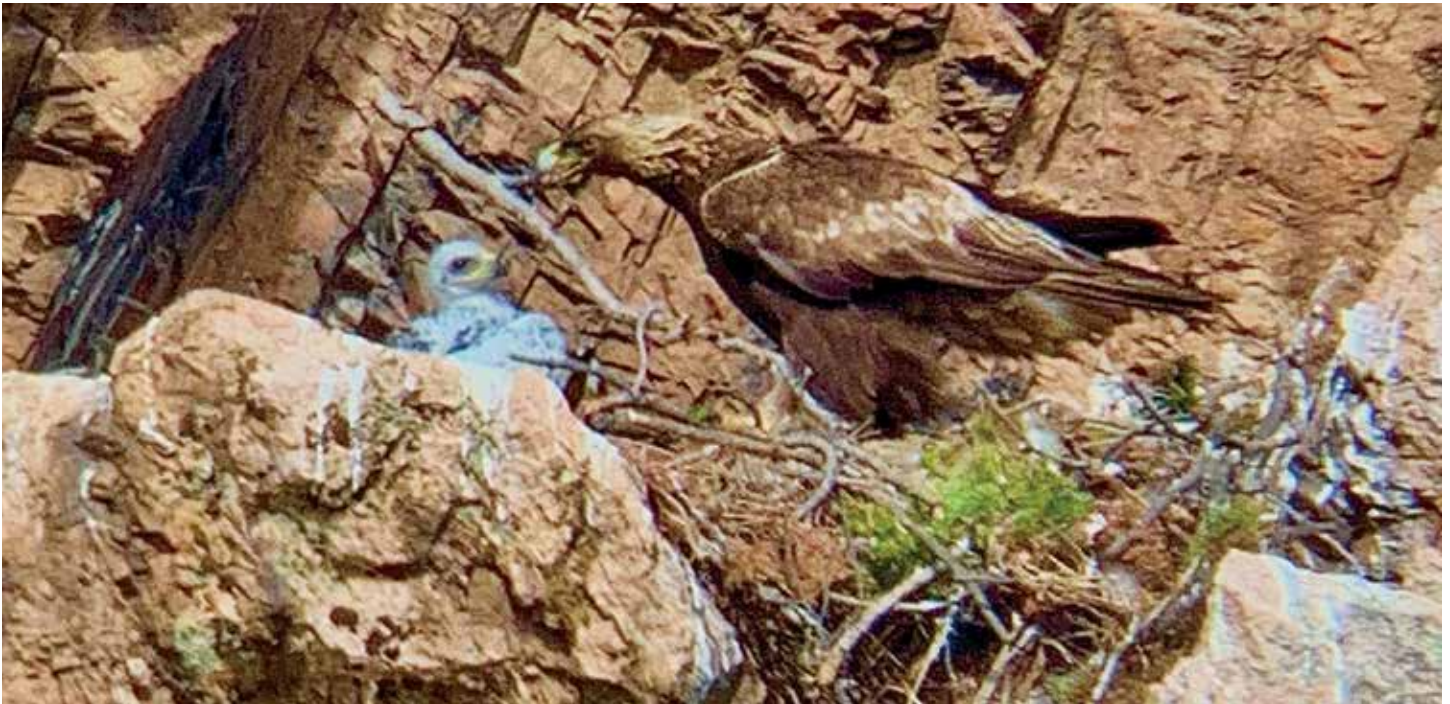
One of the Golden Eagles with a chick. The camera was 1,350 feet away from the nest.

The Golden Eagle is the most magnificent raptor that nests in Pine Brook Hills. Various pairs of Golden Eagles have been documented nesting in the Boulder mountains and in Pine Brook Hills since 1943, and probably for millennia before that! A pair nested and produced young off South Cedar Brook in 2023, 2024, and 2025, with the nest visible with a spotting scope from Linden.