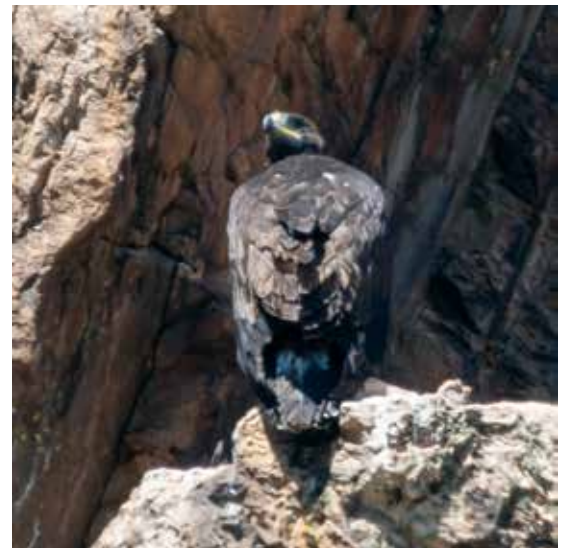
One of the adult Golden Eagles at the Pine Brook Hills nest site.

What is particularly exciting about this nesting in our neighborhood is that GOLDEN EAGLES face many threats. This is due to electrocutions at power lines, lead poisoning from carcasses left by hunters, collisions with wind turbines and vehicles, and habitat loss. Our national bird, the Bald Eagle, has recently come off the Endangered Species list, and is doing relatively well.