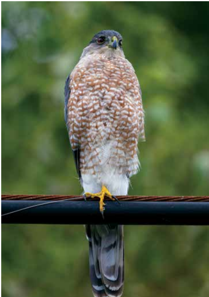
Cooper's Hawk

The elegant COOPER'S HAWK preys on birds and small mammals. They are often spotted near bird feeders where they will ambush prey. Cooper's hawks experienced a decline in the last century, likely due to the use of DDT. In good habitat with prey, populations are stable.