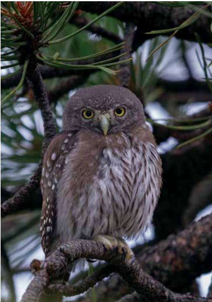
Northern Pygmy Owl

The NORTHERN PYGMY OWL , perhaps our most charming owl, nests in cavities created by woodpeckers, and in nest boxes. They weigh 2 to 2.5 ounces! Their hoot is distinctive comprised of hoots repeated at a constant pitch. They prey on small rodents, birds, lizards, and insects, and may be active in the daytime.