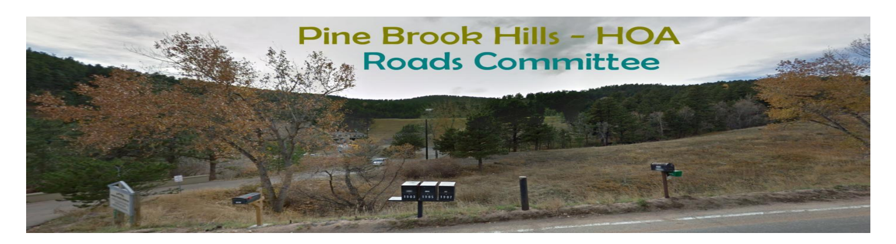
<u>Ballot Initiative Presentation – BOCC meeting August 4th 2016</u>

We respectfully ask for your support for this ballot initiative.