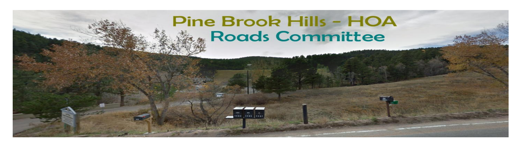
<u>Ballot Initiative Presentation – BOCC meeting August 4th 2016</u>

This initiative is designed to develop a long-term solution for the maintenance and continuing rehabilitation of subdivision roads as well as numerous unfunded roads infrastructure projects in all 10 Boulder County cities.