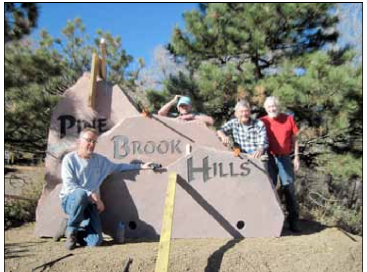
Onsite Crew